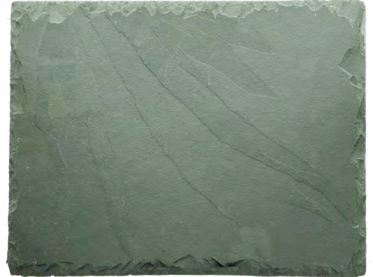
Color representation is for reference only. Contact California Slate Company for accurate color samples before final selection. Contact us for tile selection guidance.