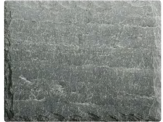
Color representation is for reference only. Contact California Slate Company for accurate color samples before final selection. Contact us for tile selection guidance.