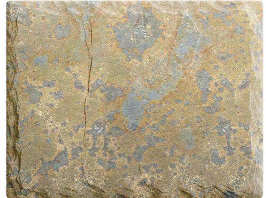
Color representation is for reference only. Contact California Slate Company for accurate color samples before final selection. Contact us for tile selection guidance.